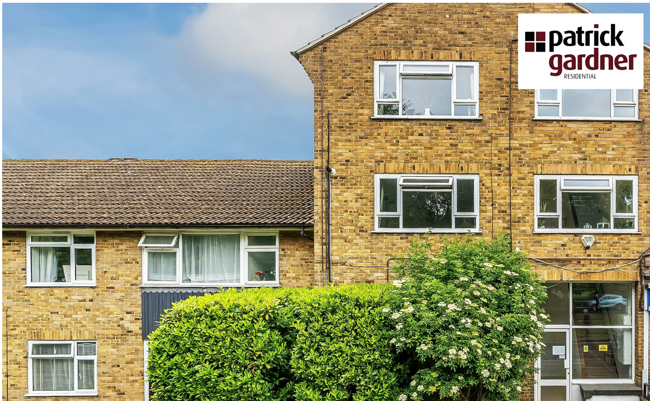
10a, Woodlodge Woodfield Lane, Ashted, KT21 2DJ